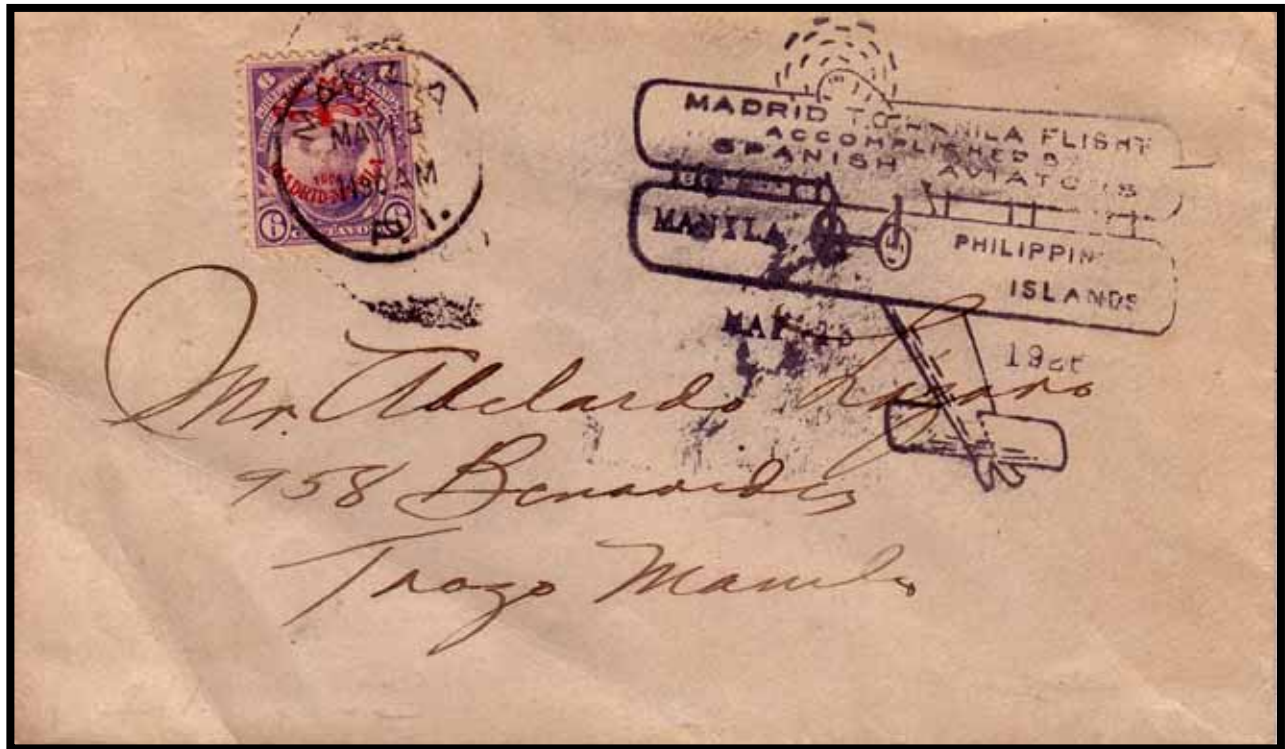
May 13, 1926 first day cover (not flown) - date flight landed in Manila.