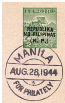
Japanese Occupation. KP–Kagamitang Pampamahalaan–is Tagalog for OB. First day cancel doubles as control (clerk #5 of 11).