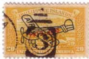
OBs using words. OFFICIAL within oval (top) and separate–red invert–(bottom), TAGLE inspired.