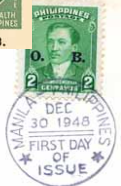
Centrally printed. 1941 BEP postal card (top) and 1948 Republic adhesive (bottom).