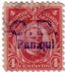
OBs with city names. Pura and Paniqui, Tarlac Province hand stamps.